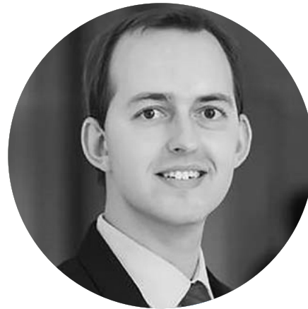
Dr. Marius Skuodis